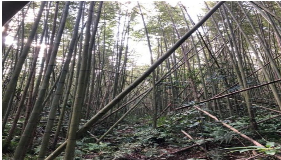
Figure 2. Bamboo stands before thinning.

1) mean ± standard deviation. The same character means no significant difference under \alpha=0.05 in ANOVA test.