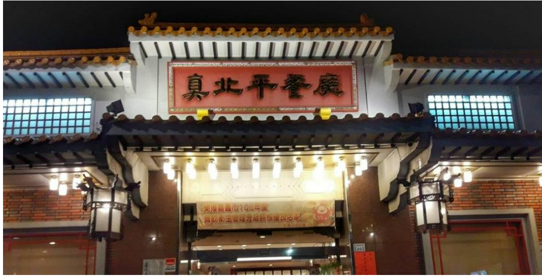
真北平餐廳 Zhen Bei Ping Restaurant