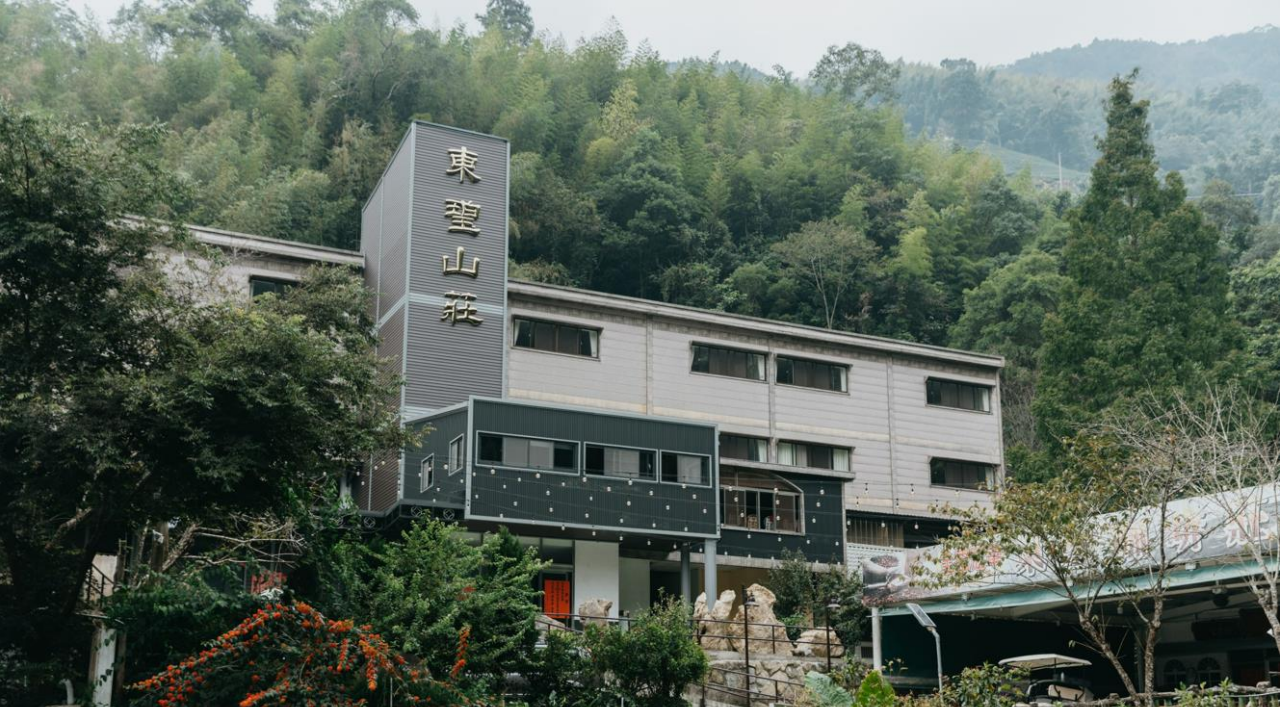
東壁山莊或同級Dongbi Villa or Similar