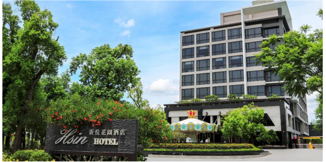
新悅花園酒店或同級 Hsin Hotel or Similar

The pictures are for reference only, the actual conditions on-site prevail.