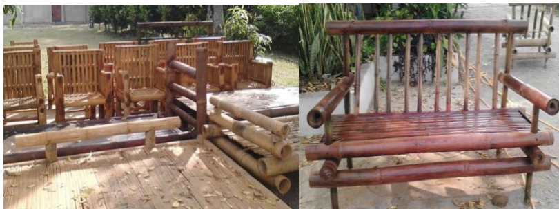
Figure 12. Round pole furniture being developed in Mandalay for resorts

Bamboo sticks is however in demand in the export market. These are being exported to Singapore and Holland and used for flower sticks and kites.