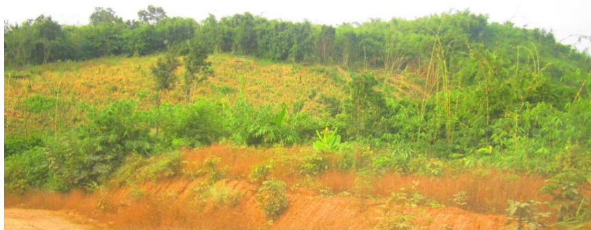
Figure 3. Shifting cultivation in bamboo forests averaging 5 hectares

Field visits in the two villages provided insights on resources in the field. Observations on the actual environmental situation of the forests in the nearby villages, available bamboo resources, status of the vegetation, farm practices, such as shifting cultivation (Figure 3) other crop vegetation, community activities and available infrastructures were documented.