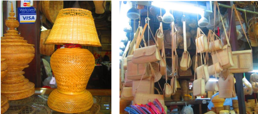
Figure 11. Bamboo products sold in tourist shops

The tourism industry in Myanmar is booming and this is a potential sector for the bamboo products offering more opportunities for value adding. A businessman and plantation owner who was visited in Mandalay was making samples of round pole furniture for beach resorts (Figure 12). At the same time, a training cum production for furniture making was being conducted to trainees coming from different villages.