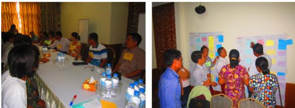
Figure 2 Focus group discussion in Dawei with stakeholders